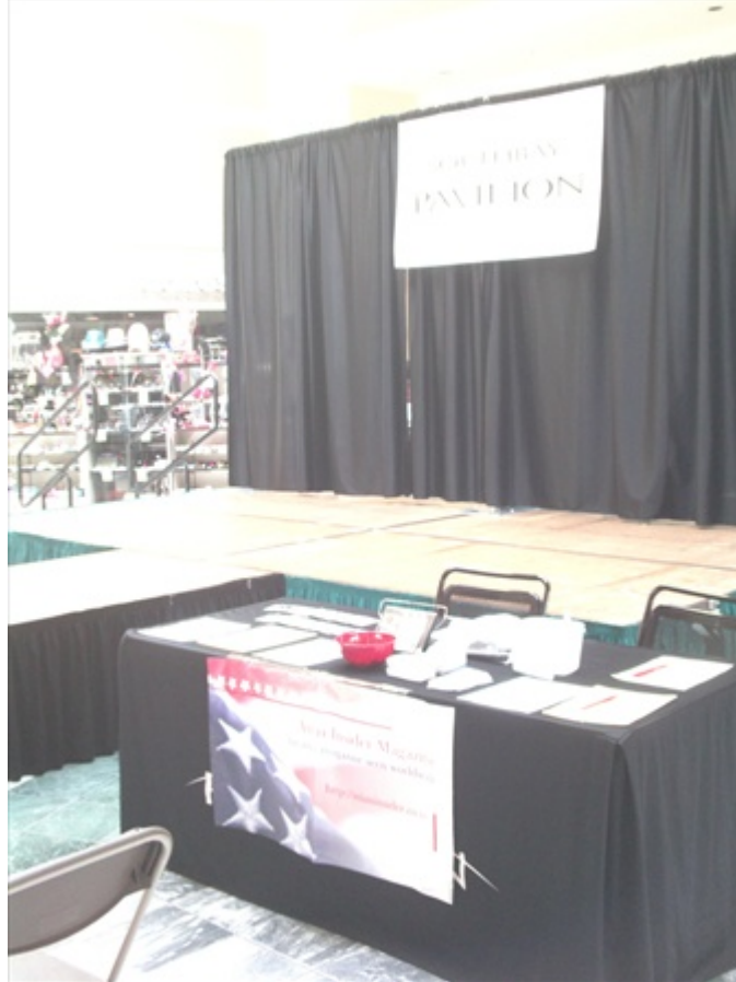
2010 Emerging Business Symposium and Vendor Fair October 21, 2010 at the Pasadena Rose Bowl