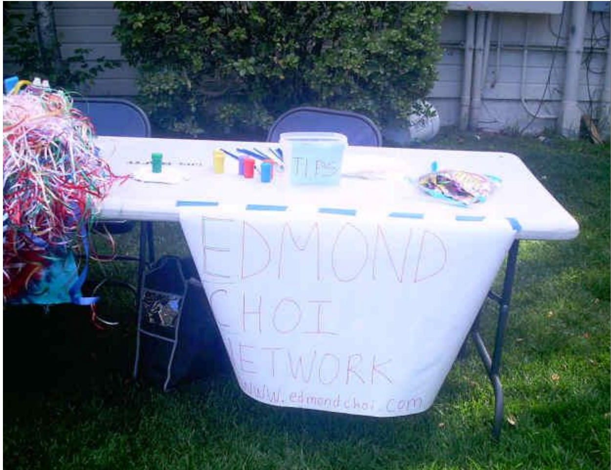
Virginia Avenue Project 2nd Annual 5K Run/Walk on May 23, 2010 at CBS Studio Lot in Studio City, CA Face Painter